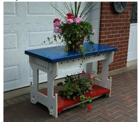
Optional Portable Work Bench Project: Past students' optional CNC project provides invaluable hands on experience with a real job. Becomes a take home item along with the project book and certificate.