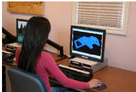
Ergonomic CAD Workstations!